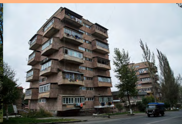
Residential Building in Dimats District