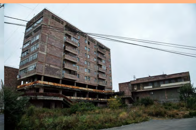
Multifunctional Building in Bazum District