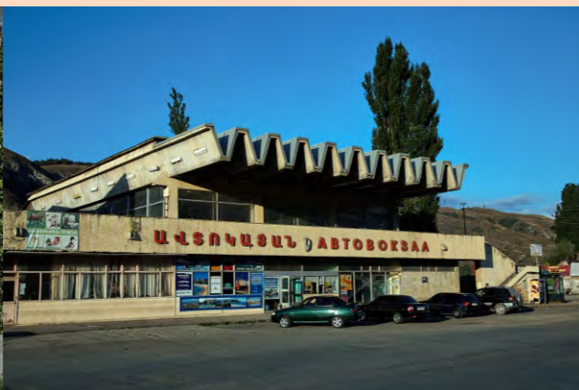
Vanadzor Train and Bus Station