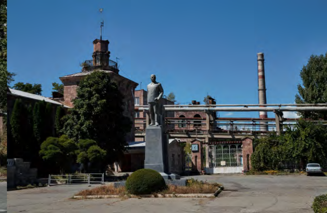
Vandzor Chemical Plant