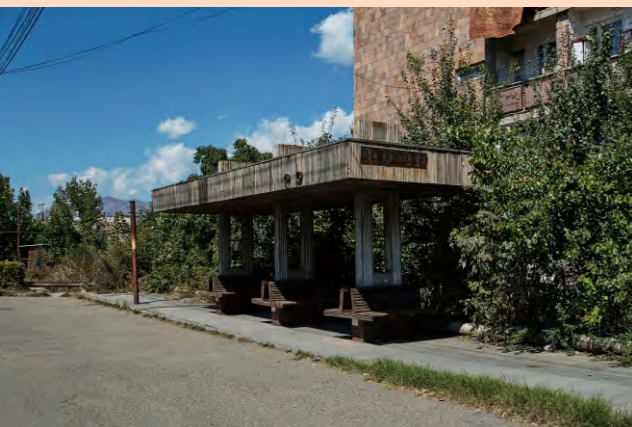
GIPK Bus stop