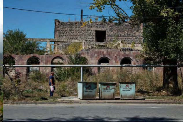
GIPK (Chemical Adhesives Factory)