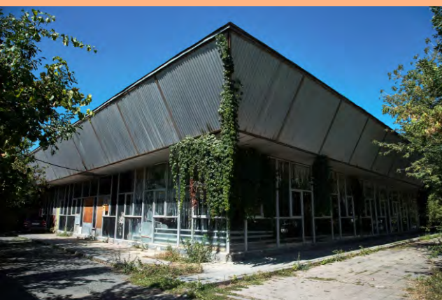
Vanadzor Puppet Theater