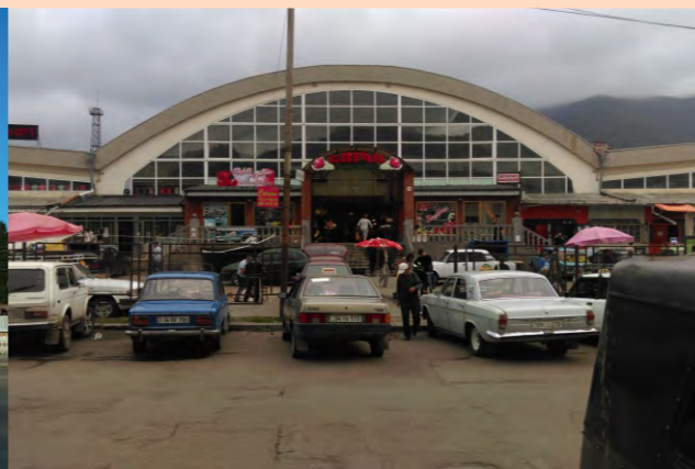
Vanadzor Central Market